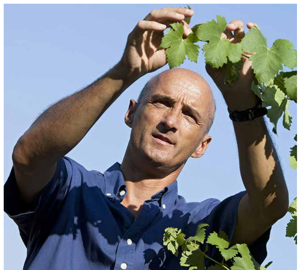
Worker at Senechaux

"... with aromas of gently toasted brioche, tangerine and lime. Plump, rich and silky on the palate, it's wonderfully long and elegant on the finish." 92-94/100 Vinous