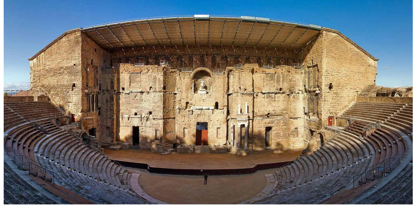
Orange's Roman theatre

It is one of the best preserved of all the Roman théâtre in France. It is the only building of its kind which still has its impressive acoustic stage wall: 103 metres long, 37 metres high, 1.80 metres thick. It hosts "The Chorégies d'Orange"—a magnificent summer opera festival held each year in August and one of the oldest festivals in France.